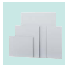
■ IP (Imaging Plate)