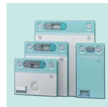
■ IP cassette