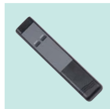
■ Remote hand switch