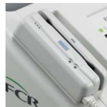
■ Card reader