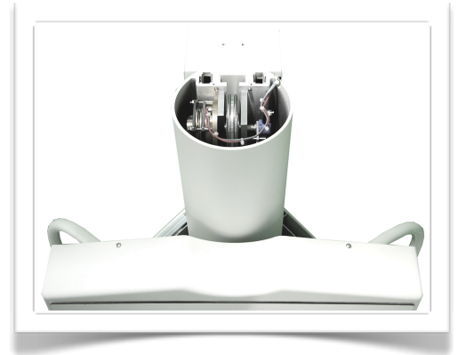
Top View With Cover Removed

CoRE labs bucky stands are manufactured to the same quality level as our tube stands and tables. "flora" & "orion" are fully counterbalanced units and use electronic positive locks (for patient & technician safety in the event of power failure). Both will accommodate buckies, grids and trays from various manufacturers. Fine adjustment counterweight systems are included.