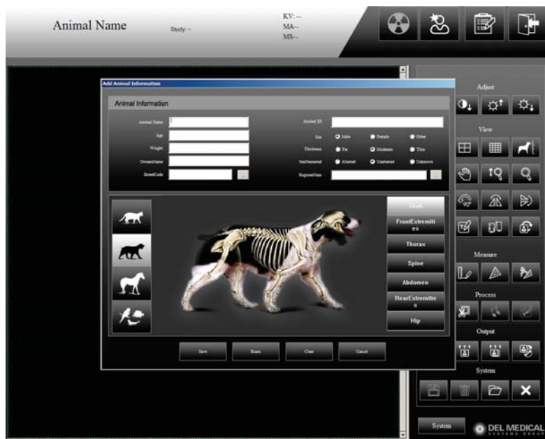
Animal information fields include breed code & registration