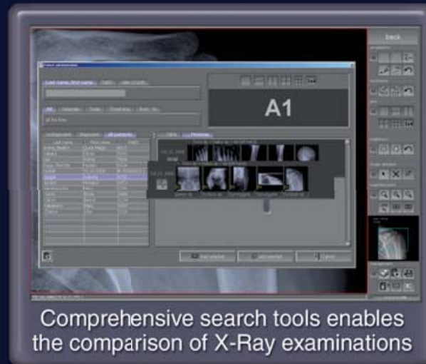
Comprehensive search tools enables the comparison of X-Ray examinations