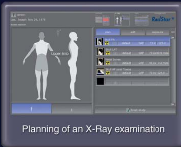
Planning of an X-Ray examination