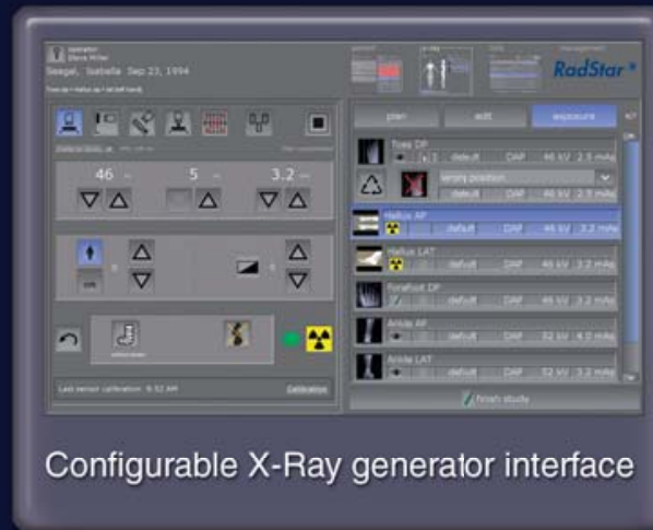
Configurable X-Ray generator interface