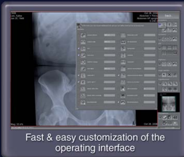
Fast & easy customization of the operating interface