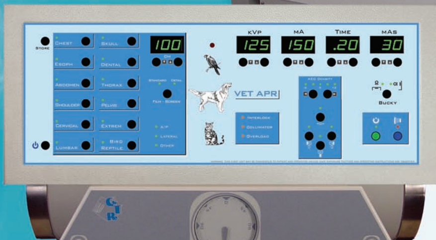
VET APR Console