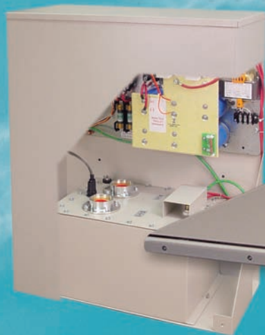
Compact Intelligen® Chassis

GTR® offers you the latest in complete radiographic x-ray systems for veterinary applications. Utilizing the GTR® Intelligen® High Frequency X-Ray Generator with the VET APR Console, the VET RAD SYSTEM allows the maximum flexibility both for your budget and your application.