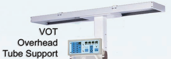
Handlebar APR Console

Eureka Linear MC150 NC Manual Collimator for optimum protection and easy use Huestis Medical CM-1000 Laser guided light beam collimator for more accurate positioning