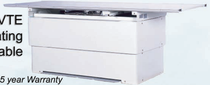
VTE Elevating Table